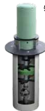
HG-3 Flushing System