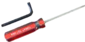
HG-A103104 Security Kit