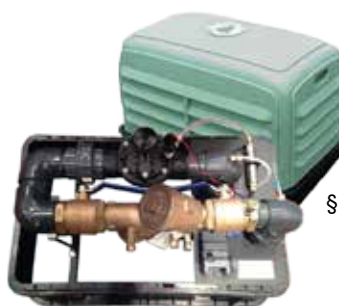
HG-2 Low Profile Flushing System

Hydro-Guard® permanent flushing systems fully automate the process for flushing water distribution lines. The units can be designed to operate reliably in warm, moderately cold, and cold climates. Designed for use with an integrated multi-event programmer, Hydro-Guard systems can flush a water line multiple times per day, seven days per week, with flush durations ranging from one minute to four hours per program. Water can be discharged atmospherically or direct into a pond or storm sewer.