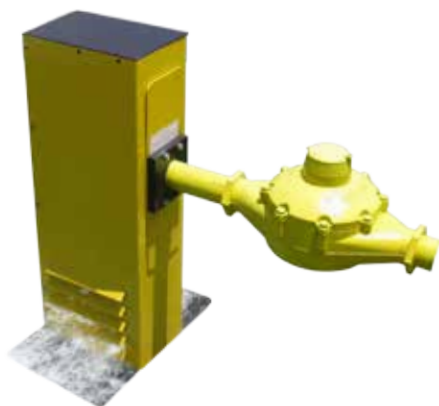
HG-6 Temporary (Portable) Flushing System

Hydro-Guard® HG-6 automatic flushing system takes automatic and programmable flushing capabilities anywhere in the water distribution system where a fire hydrant is available. It's portable and adjustable so it can be connected to the hose nozzle of any brand of fire hydrant. It is the perfect solution for temporary or emergency flushing needs.