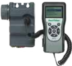
T2 Retrofit Kit