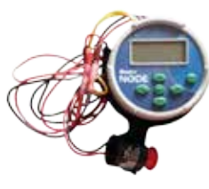
NODE Retrofit Kit