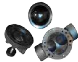
HG-123100 Control Valve