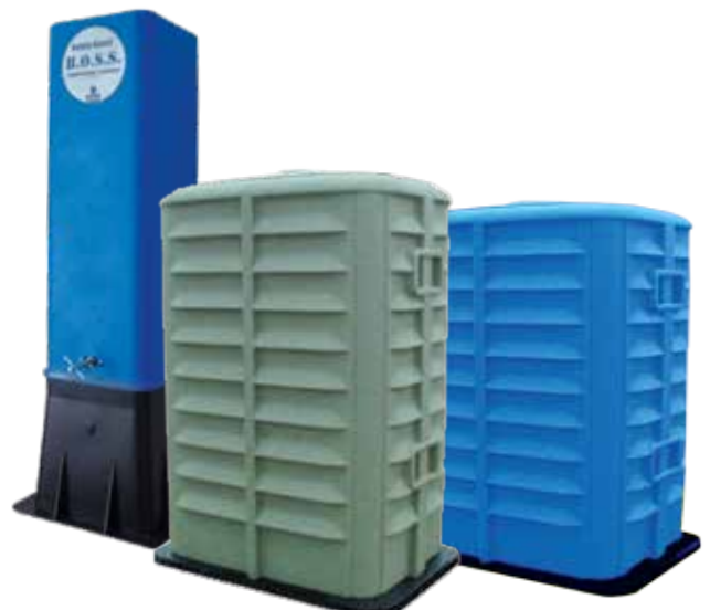
Safety Guard Enclosures