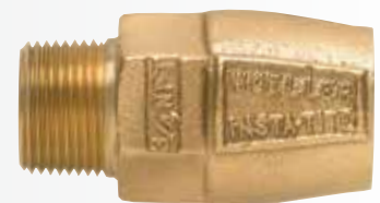
Straight coupling, inside or outside I.P. threads