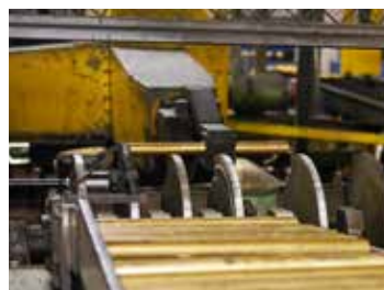
Bar stock is cut to length