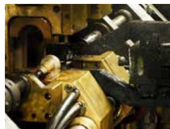
Stem is electrically heated and thrust together to create the thrust collar