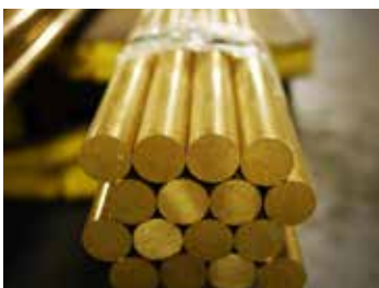
Bronze bar stock