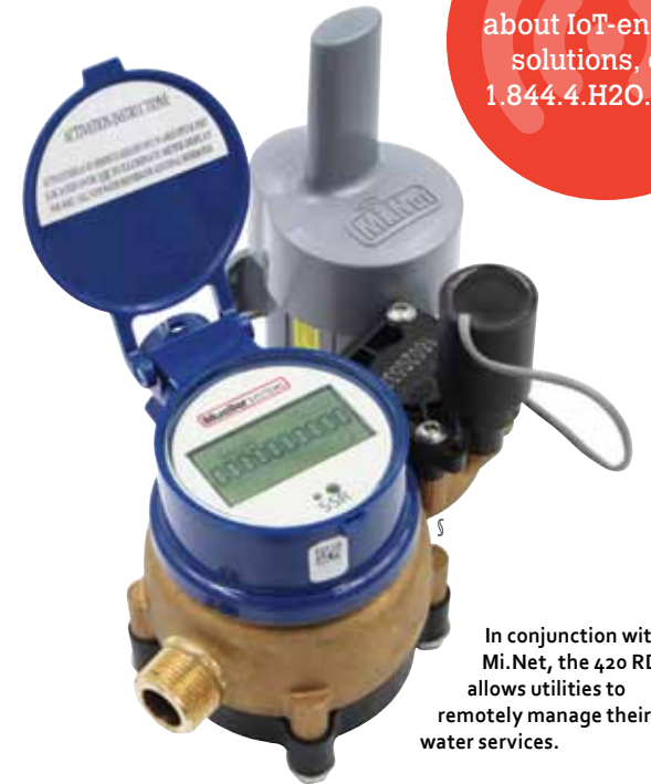
In conjunction with Mi.Net, the 420 RDM allows utilities to remotely manage their water services.

To learn more about IoT-enabled solutions, call 1.844.4.H2O.DATA