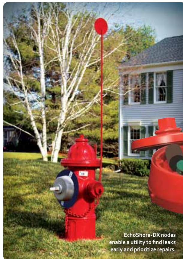
EchoShore-DX nodes enable a utility to find leaks early and prioritize repairs.

The EchoShore-DX system is scalable and migratable, an ideal way to start a new technology deployment, typically in an area of concern. Targeted deployments can be done with cellular networks, so smaller utilities without full AMI capabilities can still experience the data benefits of EchoShore-DX technology. As the EchoShore-DX system is deployed to cover larger sections of a network, it can seamlessly transition to the radio frequency or LoRa™ network, giving each utility the flexibility and time to grow its use and management of data.