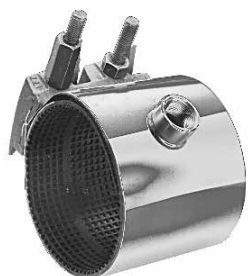
Style number 501-509