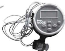
Hunter NODE with Bermad Solenoid