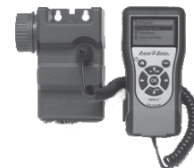
Handheld PN: 545687