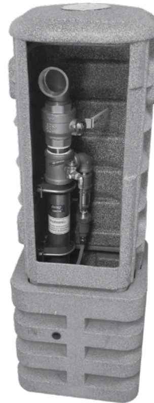
Sample Station (typ)