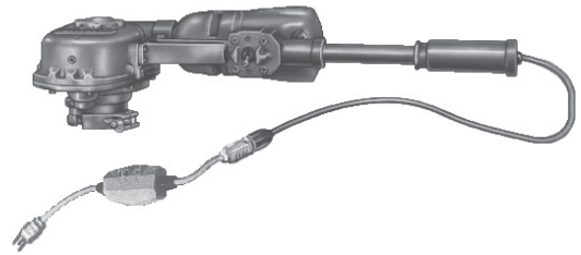
H-603 electric power operator