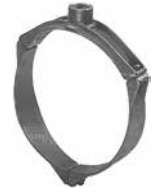
H-13000 Series 3-piece 10" & 12" mains; 3/4" to 1" tapping