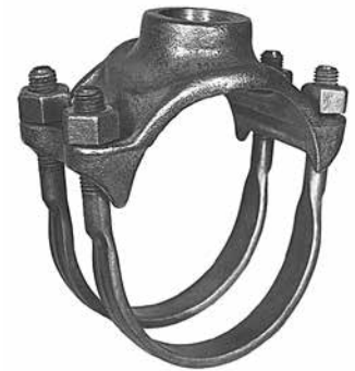
BR 2 B Series