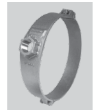
H-13000 Series 2-piece 10" & 12" mains; 3/4" to 2" tapping