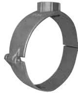
S-13000 Series 2-piece hinged 2" to 8" mains; 3/4" to 1" tapping