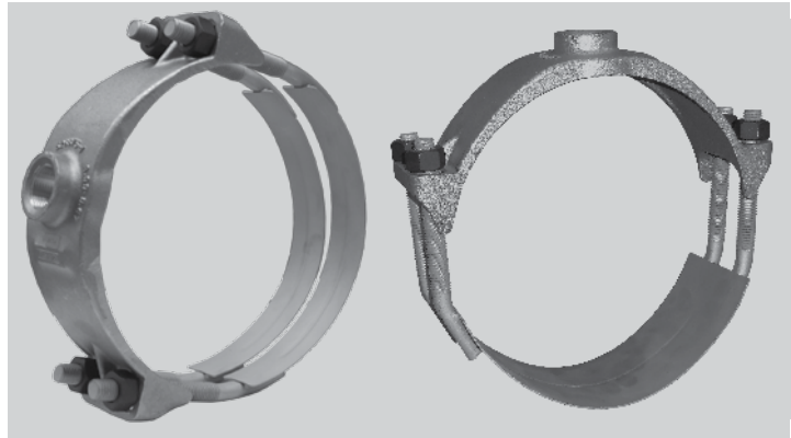
BR 2 S Series