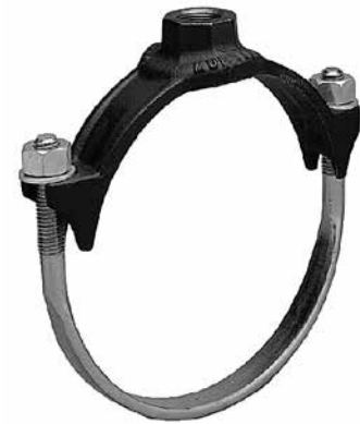
DR 1 A Series