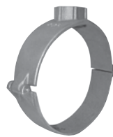
S-13000 Series 2-piece hinged 4"-8" mains; 3/4" to 1" tapping