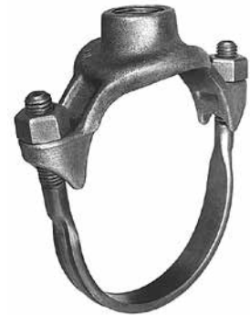
BR 1 B Series