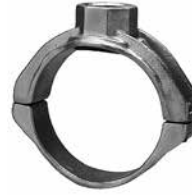
H-13000 Series 2-piece 2" to 8" mains; 3/4" to 1" tapping