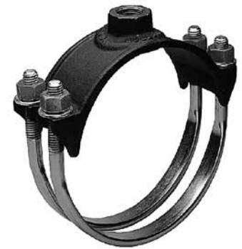
DR 2 A Series