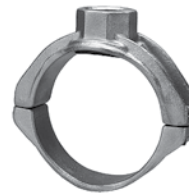
H-13000 Series 2-piece 4"-8" mains; 3/4" to 1" tapping