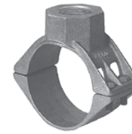
H-13000 Series 2-piece 4"-8" mains; 1/2" or 2" tapping