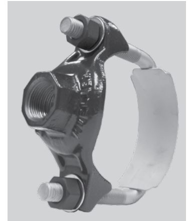
DR 1 S Series