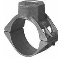
H-13000 Series 2-piece 4"-8" mains; 1-1/2" or 2" tapping