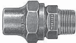
Straight coupling I.P. threaded copper flare nut x M.I.P. thread