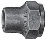
Copper flare nut I.P. threaded