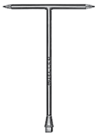
H-10356 Combination key Lengths: 18", 27", 36", and 48"

Used to open clogged Buffalo type curb boxes quickly and easily. Eliminates digging up box to reach the curb stop. One end of the handle is pointed for digging ice or dirt away from lid of box. Rod and crossbar handle are made of steel and auger spiral is made of malleable iron.