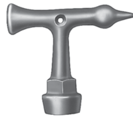
H-10323 Pentagon key - Ductile iron

For use with Buffalo type curb boxes to remove screw in lid and operate stationary shut-off rods. Will not fit tee head of curb valves or stops.