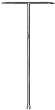
H-10321 Shut-off rod Lengths: 2', 3', 4', 5', 6', 7', 8', 10', and 12'

For use with all Buffalo type boxes and the following curb boxes: H-10300, H-10302, H-10304, H-10306, H-10308, H-10310, H-10316, H-10336, H-10385, H-10386, H-10387, H-10388 will fit stops and valves to 2" in size. One end is flattened like a chisel and the other end is pointed for digging ice or dirt away from lid of box. Made of steel.