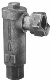
M-98™ ASSE approved top entry vertical check valve