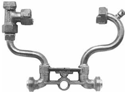
Multi-purpose thread ends (H-1405N shown)