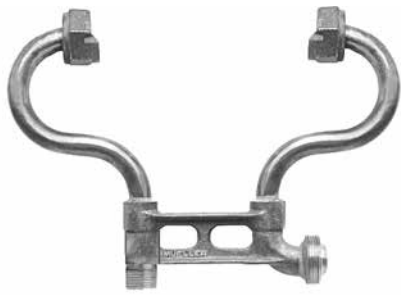
MIP vertical inlet and horizontal outlet with multi-purpose connection (H-1568N shown)