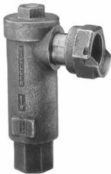
M-98™ ASSE approved top entry vertical check valve