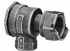
Angle dual check valve

H-1558-2AN for the ASSE approved model angle dual check valve.