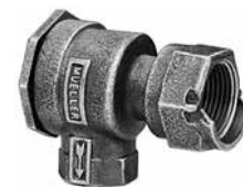
Angle dual check valve

H-1414-2AN for the ASSE approved model angle dual check valve.