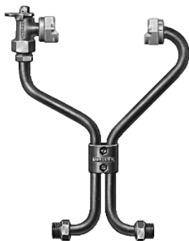
M.I.P. thread ends (H-14104N)