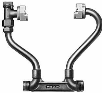
M.I.P. meter thread ends (H-14118N shown)