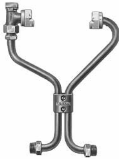
M.I.P. meter thread ends (H-14195N shown)