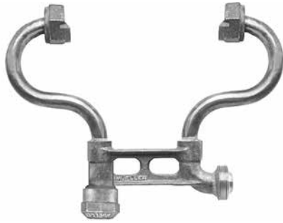
Integral Mueller 110® Compression connection inlet for CTS O.D. tubing and Multi - purpose thread outlet (B-1476N shown)