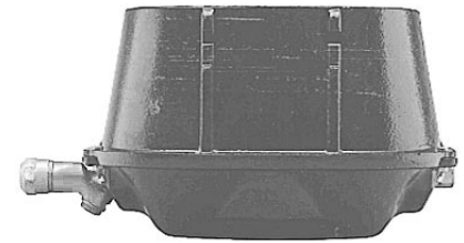
(H-1461-K N shown)

* Inlet connections are integral to the meter box.