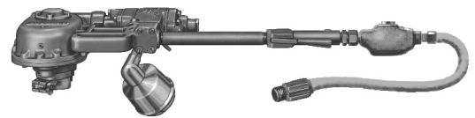
H-604 air power operator

IMPORTANT: MAINTAIN PRESSURE OF 90 PSIG—THE USE OF A GAGE AT THE THROTTLE TO DETERMINE THE ACTUAL PRESSURE OF AIR AT THE POWER OPERATOR IS RECOMMENDED. PROPER USE OF OILER IS REQUIRED TO MAINTAIN OPERATOR WARRANTY.