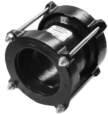
Typical 6" Coupling

Note: Compression couplings of this type do not provide resistance to pipe pullout.