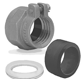
Pack Joint Kit

† 3/4" & 1" size kits (CTS only) will interchange with valves or fittings using Mueller 110 Compression Connections (CTS).