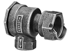
Angle dual check valve