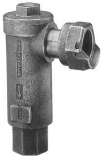
M-98™ ASSE approved top entry vertical check valve

B-2706-6D for the ASSE approved top entry vertical check with a test drain; B-2706-2A for the ASSE approved model angle dual check valve.