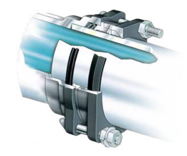
For illustration only, this bolt is shown not fully tightened; nut has not broken away. Washer used to assure proper wrench engagement is still in place (drops away once outer nut breaks off).