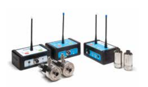
LeakFinderST<sup>™</sup> Correlator Technology