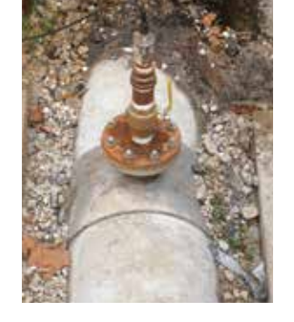
EchoWave® Leak Detection Services