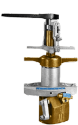
B-101™ Drilling and Tapping Machine

Mueller® Drilling & Tapping Machines are used to tap water service lines with virtually any type and size of pipe. Products feature rugged design, with proven precision and dependability for superior everyday performance. Both dry install and under pressure application models are offered. Machines range: 1/2" to 2" corporation valve insertion.