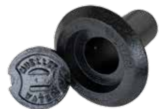
Cast Iron Lid & Ductile Iron Adjustable Top