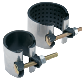
Mini-Band™ Pipe-Saver® Clamps