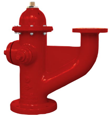
Monitor Style Super Centurion Fire Hydrant