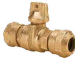
Ball Curb Valve

Curb valves & boxes from Mueller Canada feature an extensive line of products and a full range of box accessories, including shut-off rods, augers and keys. Curb valve styles include Mueller 300™ ball valves, Oriseal® plug and ground key types.