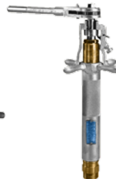
D-5™ Drilling Machine