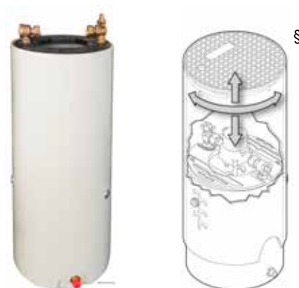
Adjusta-Coil™ PVC Meter Box

PVC meter boxes & vaults from Mueller Canada offer strength and light-weight construction, for shipping and handling convenience. They come fully assembled and factory tested. Many styles are available for single and tandem installations, as well as protection against extreme cold weather. Choice of iron or composite plastic lids, which allow radio AMR monitoring and are virtually transparent to R.F. signals. Bury depths: 10" to 120". Meter box sizes: 15" to 36" diameters.