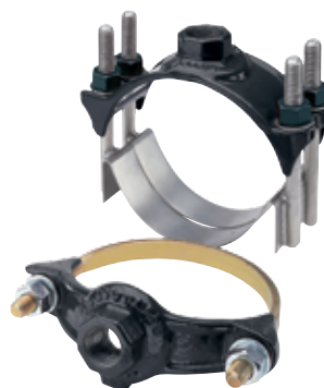
Ductile Iron Service Saddles

Service saddles from Mueller Canada are available in bronze and ductile iron and are used for making service line connections. Different designs are available for use on any type of pipe material or size of main. All saddles form a tight connection between the main and service line and feature an O-ring fit into a dimensionally-controlled groove, which eliminates creep and seal blowout, or need for a gridded mat type gasket.