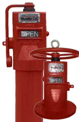
Wall and Post-type Indicator Posts