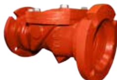
Flex Check Valve