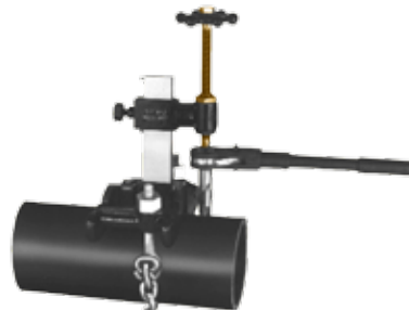
“J”™ Drilling and Tapping Machine