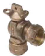
Mueller® 300™ Ball Angle Meter Valve

Meter setting materials from Mueller Canada include both copper and cast iron yokes in hundreds of configurations sure to fit any application. Styles include: adjustable yokes, meter relocators, various straight and angle meter valves, and ball valve, Oriseal® plug and ground key designs, in-line, angle and top entry dual check valves, cast iron meter boxes, meter couplings, pit and manhole covers, keys, locks, meter bushings and idlers.