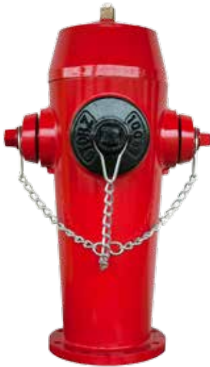
Canada Valve™ Century™

Mueller® fire hydrants are known throughout Canada for their rock-solid reliability and ease of use. Products include Canada Valve™ Century™, Darling®, Super Centurion®, and Modern™ dry barrel brands as well as spin-in, flush and post-type hydrants. They feature superior flow characteristics, dependability, and aftermarket support. Accessories, repair kits, and parts for discontinued models are also available.