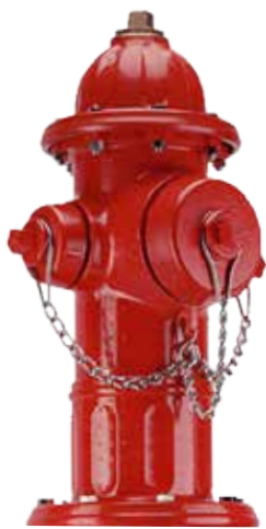
Super Centurion® Hydrants

Mueller Canada is a leader in providing high-quality commercial and institutional fire protection products, offering a broad range of carefully designed, durable, reliable and easily maintained fire protection products that are UL and FM compliant. Plus, all Mueller® products are backed by the company's expert technical support, superior service and ready parts availability. Mueller UL / FM fire protection products set the standard for performance and reliability.