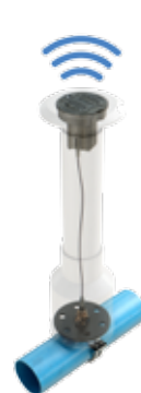
Roadway & Sidewalk Installation