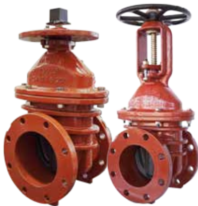
PIV and O.S. & Y. Resilient Wedge Gate Valves