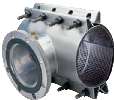
Stainless Steel Tapping Sleeves