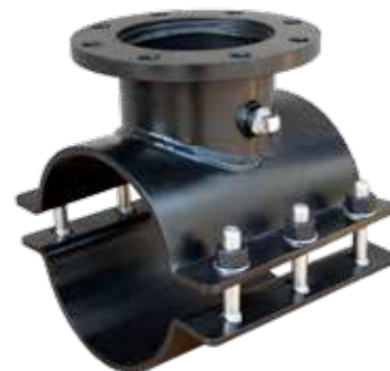
Fabricated Steel Tapping Sleeves