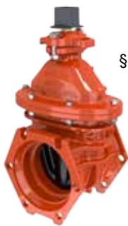
350psi Ductile Iron Resilient Wedge Gate Valve (Available 4” - 12”)

Mueller® Resilient Wedge Gate Valves feature a forged bronze stem (through 16”) and thrust collar for superior strength, an elastomer-encapsulated ductile iron wedge and engineered plastic guides to stabilize the wedge and prevent binding. Mueller Canada offers sizes from 2” to 54” with maximum working pressures ranging from 250psig (1725kPa/17 barg) to 350psig (2400kPa/24 barg). Connection options include: mechanical joint (MJ), flanged (FL), slip-on (SL), radial compression (RAD), and threaded (THD). Double disc gate valves are also available.