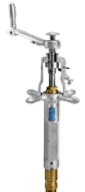
E-5™ Drilling Machine