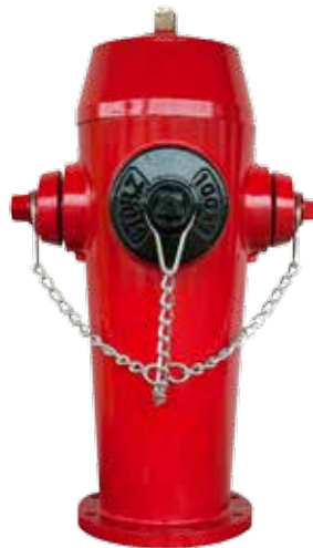
Canada Valve™ Century™