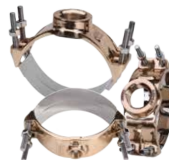
Bronze Service Saddles