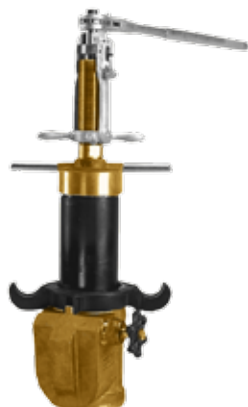
A-3™ Drilling and Tapping Machine