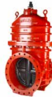
175-250 psi Ductile Iron Resilient Wedge Gate Valve (Available 14” - 54”)