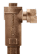
Angle Meter Check Valve