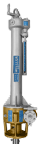
C1-36-99002™ Drilling Machine