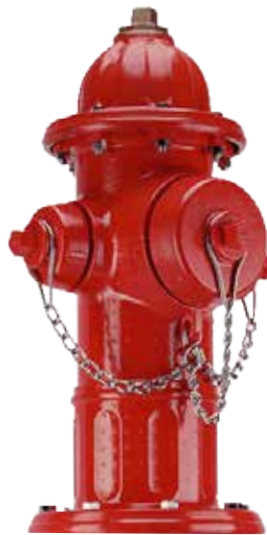
Super Centurion® 250™