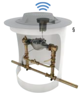
Meter Vault Installation