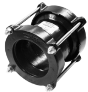
Maxi-Range Pipe Coupling