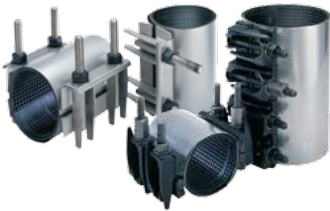
Stainless Steel Repair Clamps

Tapping products include Mueller tapping sleeves and crosses in ductile and cast iron, as well as sleeves in stainless steel. Most tapping sleeves and crosses cover a pipe size range of up to 24" and valves up to 48".