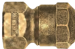
Corporation valve couplings