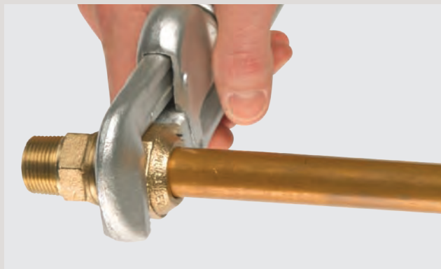
Insert the pipe and bottom out the nut