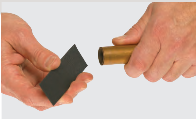
Clean the pipe