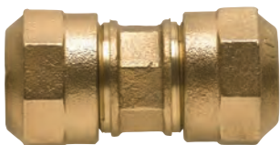
3-part unions, 1/8" & 1/4" bend couplings, "U" & "Y" branches and tees

A stainless steel gripper band overlaps itself so no gasket material can get underneath.