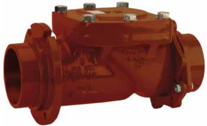
SA-SERIES CHECK VALVE WITH INTEGRAL MJ ENDS

The body seat is at a 45 degree angle to reduce the travel of the disc to the full open position, and significantly reduce the potential for water hammer when closing. The flow area is equal to or greater than the equivalent pipe size throughout for low head loss. The valve is suitable for horizontal or vertical (upward flow) mounting and is rated at 250 psig (1725 kPa/17 barg).