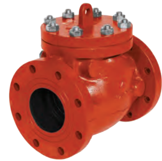
Swing Check Valve (Mueller® A-2120-6BB)