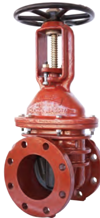
OS&Y Resilient Wedge Gate Valve (R-USP1)