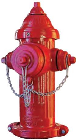
Sentinel 250™ Fire Hydrant

U.S. Pipe Valve & Hydrant fire hydrants are known throughout the fire protection industry for superior flow characteristics, dependability, ease of repair, and aftermarket support. Metropolitan®/M-94 and Sentinel® hydrants are manufactured in an ISO 9001 facility in Albertville, Alabama, USA and are backed by a 10-year limited warranty on materials and workmanship.