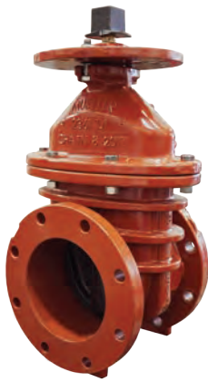
350psi Post Indicator Resilient Wedge Gate Valve (PIV) (P-USP1)

U.S. Pipe Valve & Hydrant UL listed and FM approved check valves are gravity operated, swing check design. These check valves are rugged in construction and simple in design.