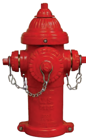
M-94 / Metropolitan Fire Hydrant