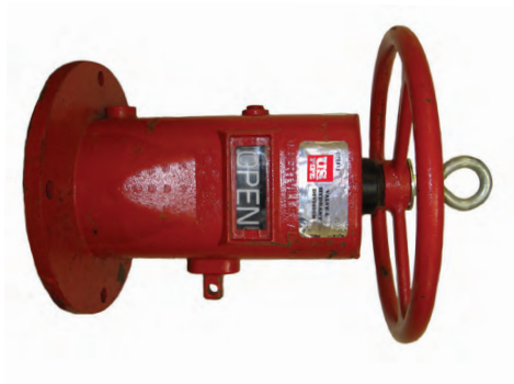
Wall-Type Indicator Post (U-20814 4"-14")

U.S. Pipe Valve & Hydrant indicator posts are used in fire protection systems and perform several functions. The indicator post provides a means to operate a buried or otherwise inaccessible valve. Also, the indicator post readily and clearly indicates whether the valve is open or shut.