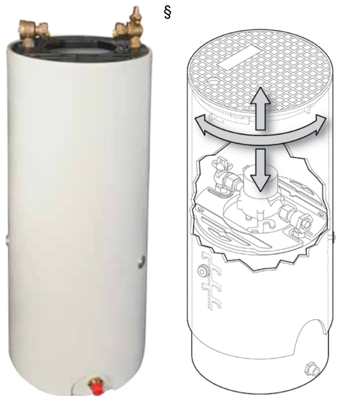
Platform in raised position