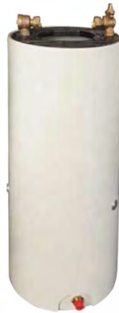
PLATFORM IN RAISED POSITION