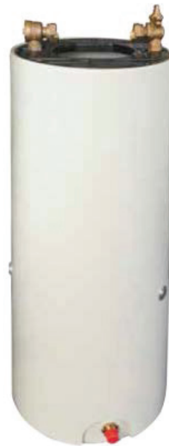
PLATFORM IN RAISED POSITION