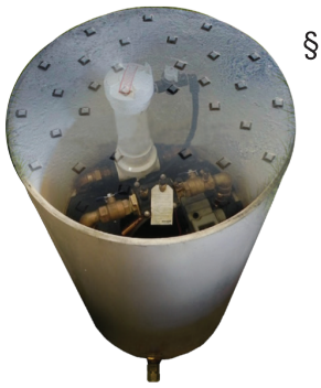
HG-8 COLD CLIMATE FLUSHING SYSTEM