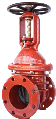
Image shown with 4" & 6"/DN100 & DN150 bonnet/yoke combo. 8" - 12"/DN200 - DN300 bonnet and yoke are two pieces. Contact us for option details.