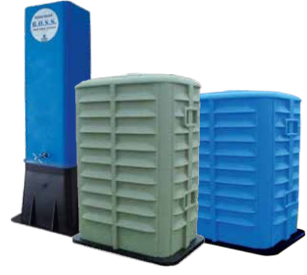
Safety Guard Enclosures