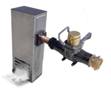
HG-6 Temporary (Portable) Flushing System

Hydro-Guard® HG-6 automatic flushing system takes automatic and programmable flushing capabilities anywhere in the water distribution system where a fire hydrant is available. It's portable and adjustable so it can be connected to the hose nozzle of any brand of fire hydrant. It is the perfect solution for temporary or emergency flushing needs.