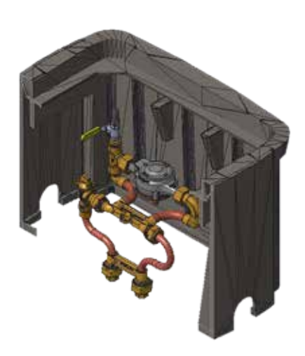
Below Ground Sampling Station