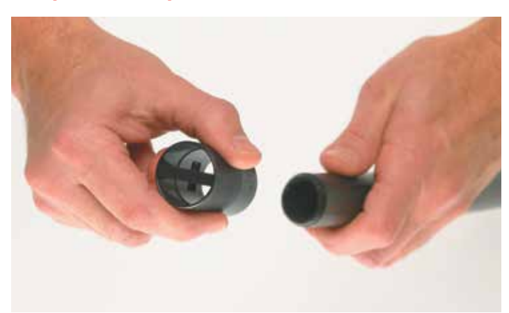
Bevel tubing or pipe end