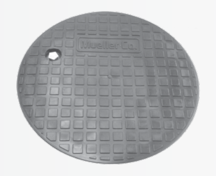
Composite Meter Lid