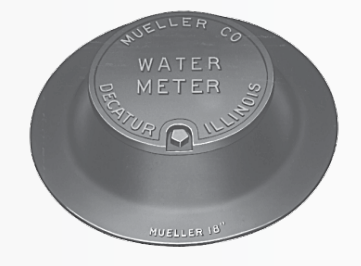
Cast Iron Covers