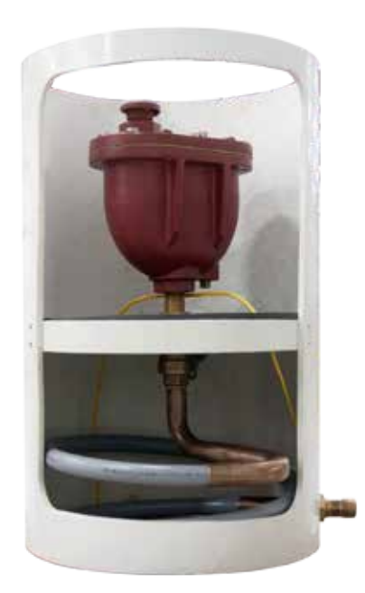
Air Release Valve with Thermal-Coil Design