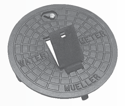
Flat Meter Lid with Reader Lid