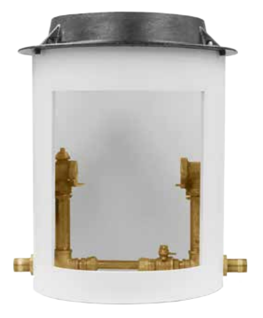
Thermal-coil® Rizer EZ-Setter®