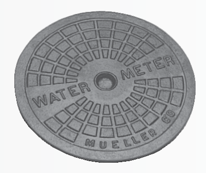
Flat Meter Lid (no lock)