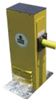
Hydro-Guard® HG-6 Hydrant Automatic Flushing System