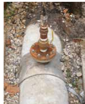
EchoWave® Leak Detection Services