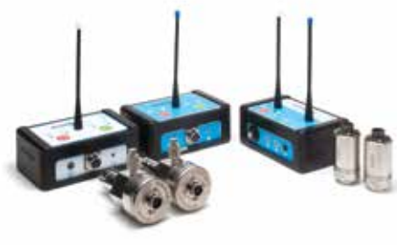
LeakFinderST™ Correlator Technology