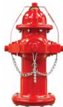
Fire Hydrant Security