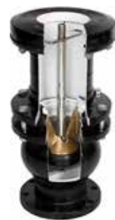
Jones® Tell-Tail™ Break-Off Check Valve for Wet Barrel Hydrants