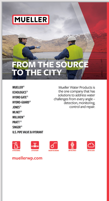
Trade show graphic