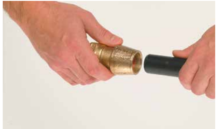
Stab it into the connection