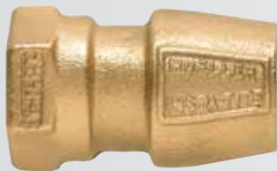
Corporation valve coupling

Also available on selected curb and corporation valves: