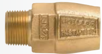
Straight coupling, inside or outside I.P. threads