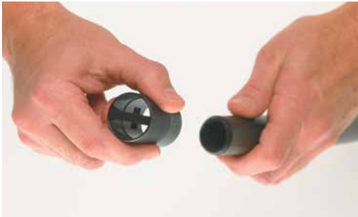
Bevel tubing or pipe end