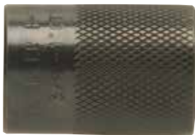
PE pipe beveling tool