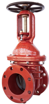
Image shown 2"–6"/DN50 – DN150 bonnet/yoke combo. 8"–12"/DN200 – DN300 bonnet and yoke are two pieces. Contact for option details.