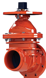
Flange X Groove Ends