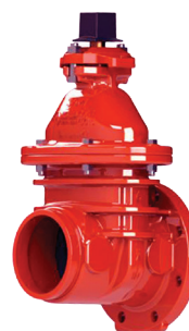
FLANGE X GROOVE ENDS